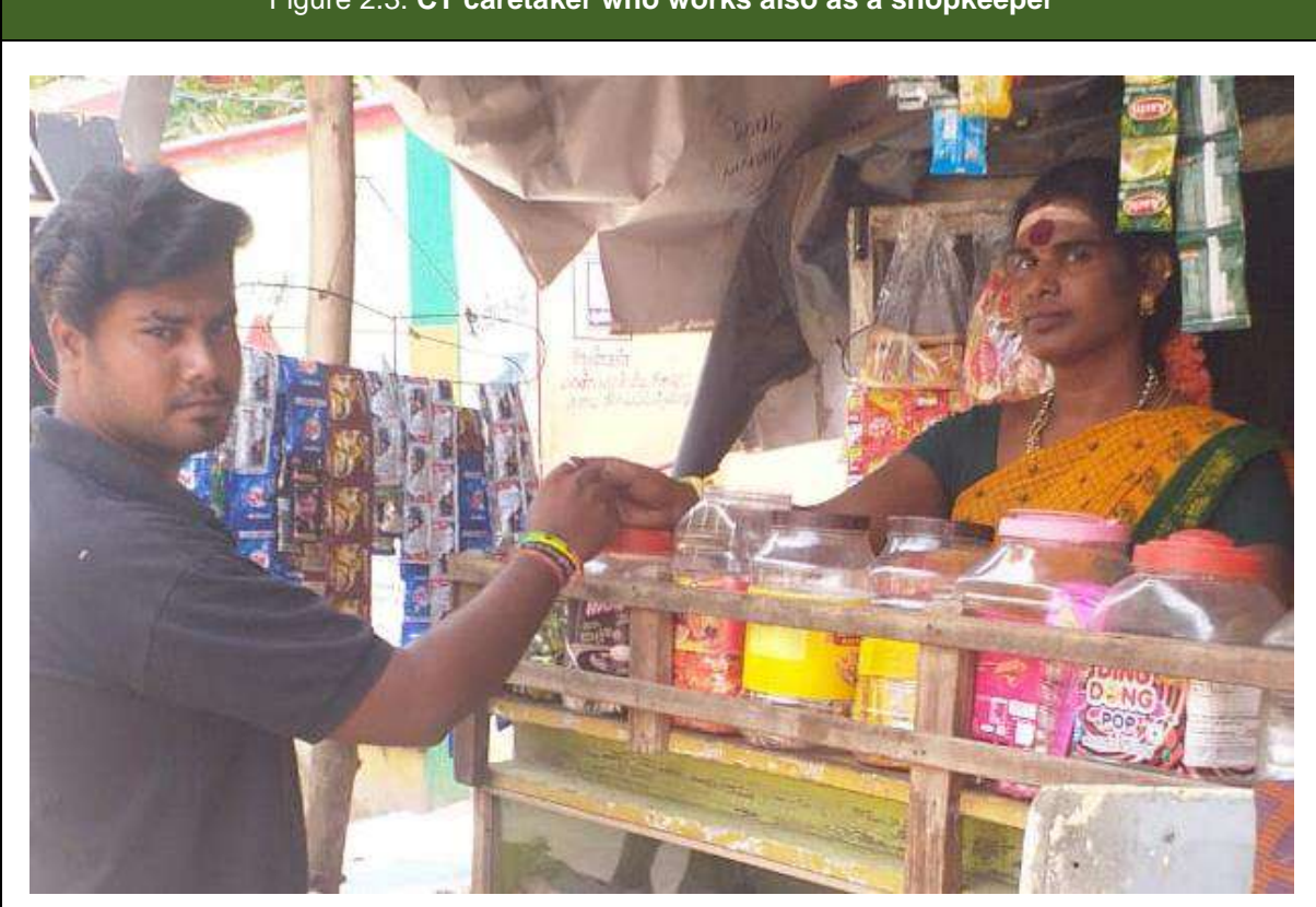
Figure 2.3: CT caretaker who works also as a shopkeeper

TNUSSP identified 15 beneficiaries among the non-contractual and informal sanitation workers to help them explore alternative livelihood opportunities through skill development and vocational training. Efforts are underway to connect with organisations that can impart training and create employment opportunities. Initial pilot tests are being conducted with training sessions focused on tailoring. Other vocational training programmes such as phenyl-making, soap-making, mobile phone repair, two-wheeler repair, and beautician training are underway. Assistance for job placements for nearly 230 beneficiaries are in progress.