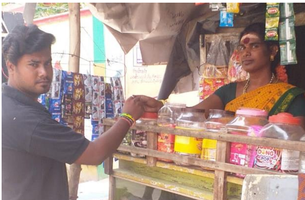
Figure 2.3: CT caretaker who works also as a shopkeeper

TNUSSP identified 15 beneficiaries among the non-contractual and informal sanitation workers to help them explore alternative livelihood opportunities through skill development and vocational training. Efforts are underway to connect with organisations that can impart training and create employment opportunities. Initial pilot tests are being conducted with training sessions focused on tailoring. Other vocational training programmes such as phenyl-making, soap-making, mobile phone repair, two-wheeler repair, and beautician training are underway. Assistance for job placements for nearly 230 beneficiaries are in progress.