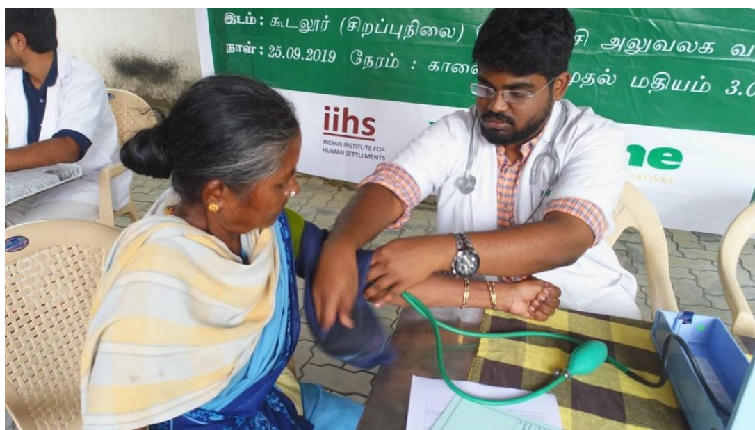
Figure 2.2: Health camp conducted for sanitation workers