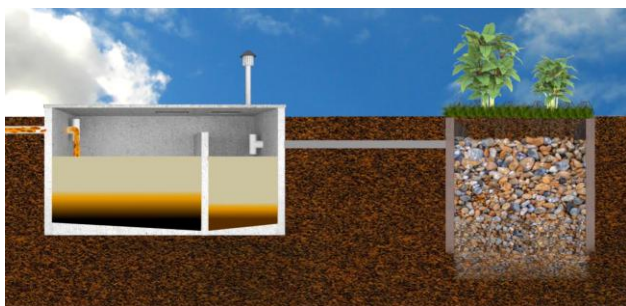
Cross Sectional View of Septic Tank and Soak Pit

The umbrella campaigns are broad and address overarching issues like propagating septage management as a viable alternative to sewerage-based solutions, and bringing into public consciousness the role of the everyday sanitary worker by valourising his/her role. Examples of these were the films on septage management and the full cycle of sanitation. The former uses two ten-minute films—one directed at senior level decision-makers and UL8 leaders and