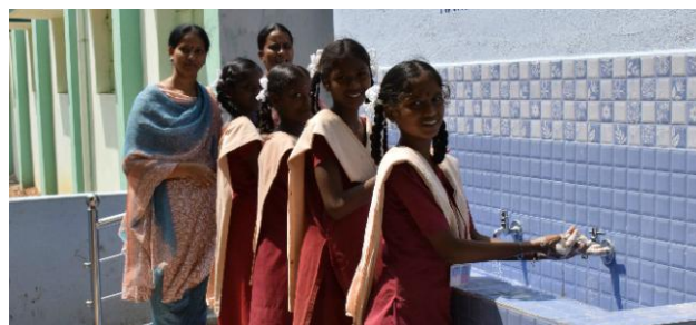
School Sanitation Promotion

Another example is the promotion of hygiene and sanitation practices amongst school-going children, meant to create a supportive environment to enable behaviour change.