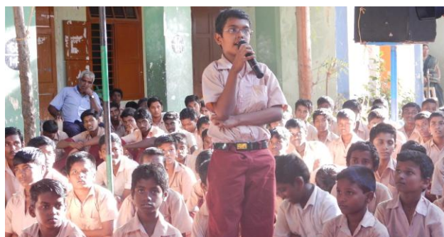
School Sanitation and Hygiene Promotion Programme, Trichy

Activities included various interactive learning sessions, quiz programmes, competitions, and cultural events in schools situated in the project locations of Periyanaicke-palayam, Narasimhanaicken-palayam and in Tiruchirappalli (also known as Trichy).