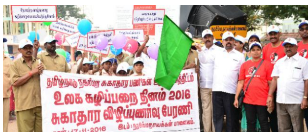
World Toilet Day Celebration 2016, PNP