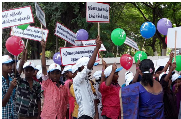
Figure 3.1: Awareness rally