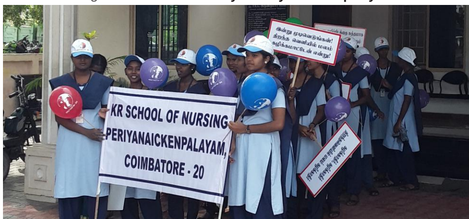
Figure 4.10: Awareness rally in Periyanaicken-palayam

Nearly 200 participants including schoolchildren and sanitary workers from the Town Panchayat participated in the rally. During the rally, messages on sanitation mounted on a vehicle were displayed along with playing of audio messages. This event included a quiz contest on sanitation with rewards being given to participants for the correct answers.