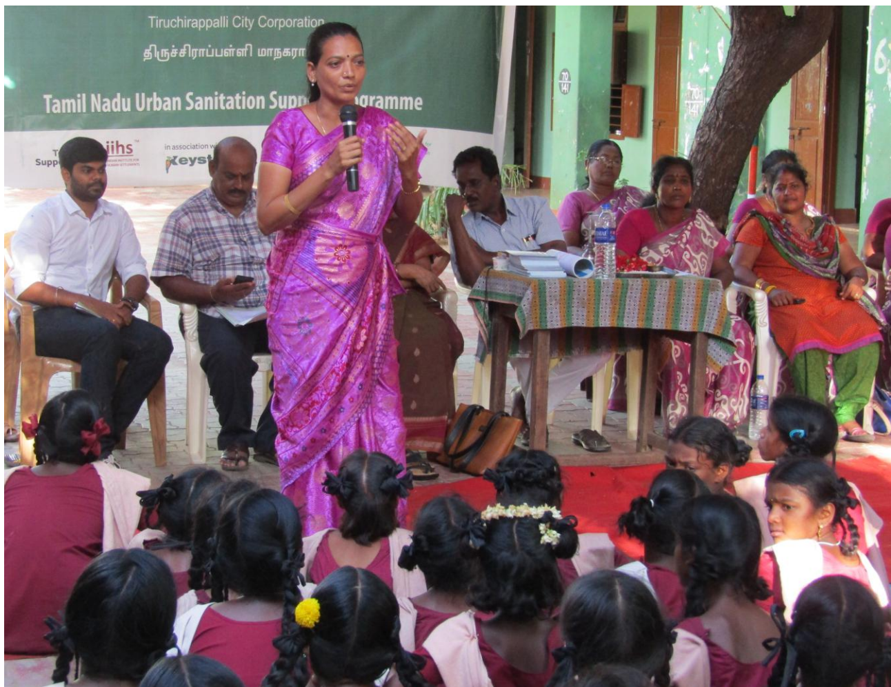
Figure 2.1: Health Educator, Gramalaya addressing the students

School children, being among the most impressionable members of the society, are seen as change agents when effecting any kind of behaviour change or socially relevant programmes. Therefore, TNUSSP decided to work with children, promoting them as change agents to inculcate healthy sanitation practices and to influence behaviour change in their families and in the community. SSHP programme was seen as an important means of implementing TNUSSP's BCC strategy. Children studying in both government and private schools from Grades 6 to 12, in Tiruchirappalli Corporation, Periyanaicken-palayam and Narasimhanaicken-palayam Town Panchayats of Coimbatore were the target groups of the programme.