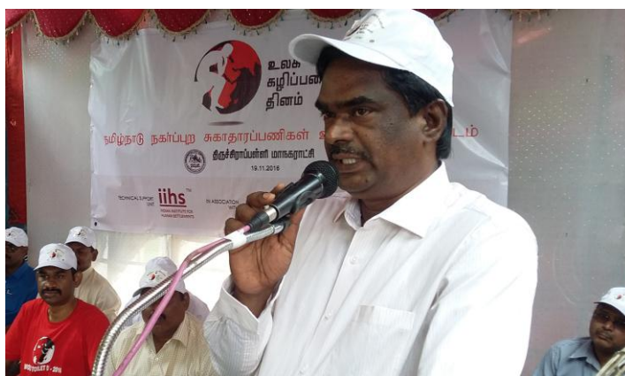
Figure 4.7: Thiru. Ravichandran, Tiruchirappalli Commissioner, addressing the community and SHG members

A sensitisation programme for 100 women self-help group members was organised near the Viragupettai community toilet, with the Tiruchirappalli Commissioner inaugurating the programme. The messages focussed on the full cycle of sanitation, and importance of keeping community toilets and public toilets clean and neat. Each woman further worked towards sensitising 50 more women in their work place.