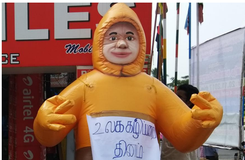
Figure 5.2: Balloon symbolising Kakkaman placed in Narasimhanaicken-palayam & Periyanaicken-palayam