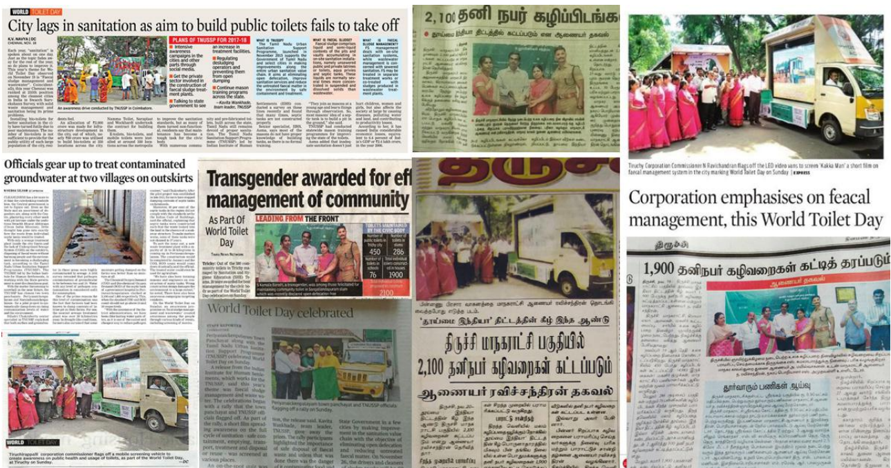
Figure 5.7: Media coverage from Trichy and PNP/NNP