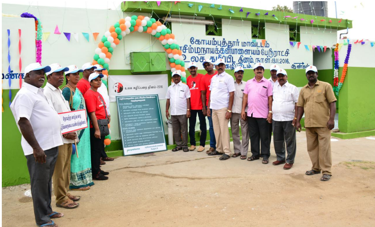
Figure 4.11: Decorated toilet, Narasimhanaicken-Palayam

All public and community toilets in the Town Panchayat were cleaned and one toilet in Vivekanandhapuram was decorated as a model toilet. Also, toilet ethics were introduced, which will be replicated across the Town Panchayat.