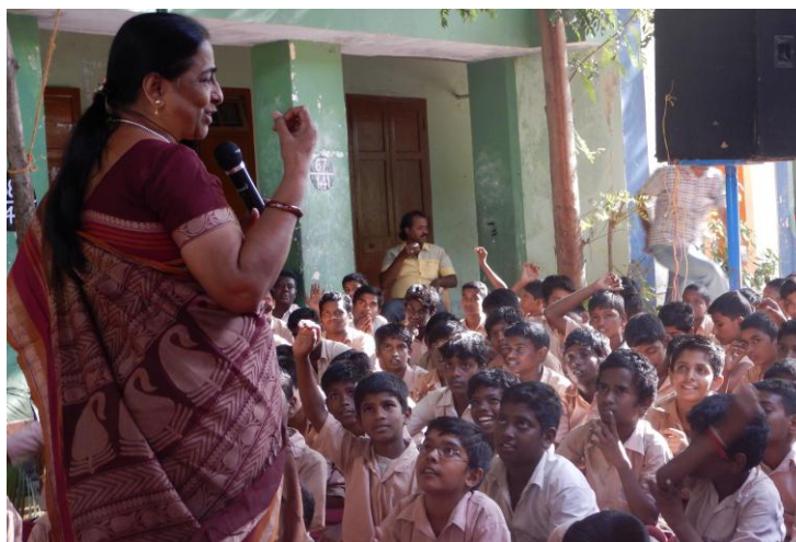
Figure 4.1: Resource Person Interaction