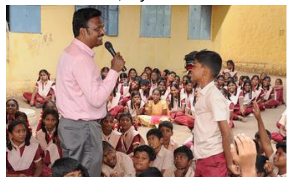
Figure 4.3: Quiz competition facilitated by Ramakannan, Keystone Foundation