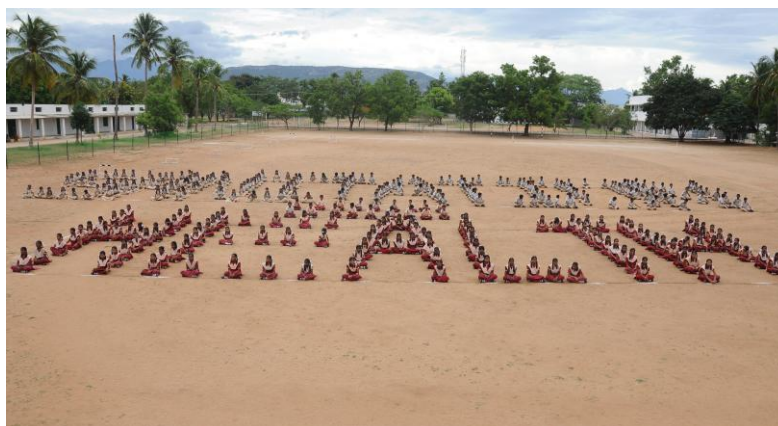
Figure 4.5: Students formation showing sanitation equals health, Periyanaicken-Palayam