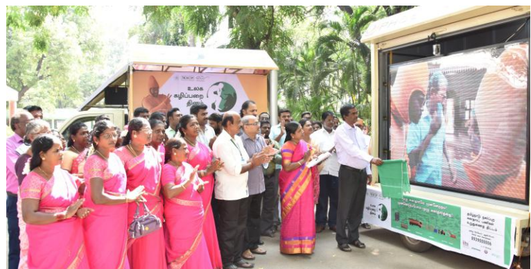
Figure 5.6: Flagging of travelling film by Tiruchirapalli Commissioner Thiru. Ravichandran

In Trichy, a formal programme was held at the Trichy City Corporation premises, which was attended by Thiru N Ravichandran, Tiruchilapalli Commissioner, Tmt Amuthavalli, City Engineer and Thiru Mr Mayilvaganan, Deputy Commissioner of Police apart from IIHS team members. The dignitaries spoke on the importance