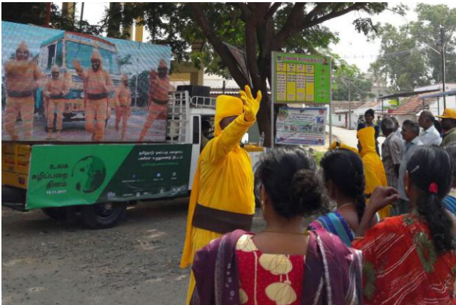
Figure 5.5: Video screening in public places in Periyanaicken-palayam