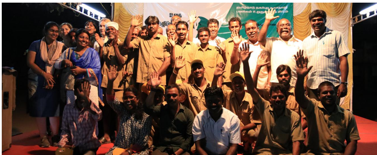
Figure 5.3: Felicitation of sanitary workers at Narasimhanaicken-palayam

A public meeting was organised at the Govt. High School, Narasimhanaicken-palayam the same evening. Local residents, members of SHGs, students from different schools and colleges, owners of commercial establishments etc. participated in the programme. The Executive Officer of the Town Panchayat welcomed the gathering, and inaugurated the programme. TNUSSP team members along with staff from Keystone Foundation spoke about the importance of WTD and the need for safe disposal of wastewater. A