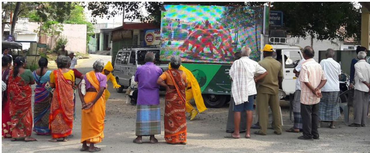
Figure 5.1: Kakkaman film screening at Narasimhanaicken-palayam