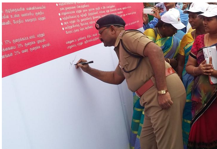
Figure 4.6: Deputy Commissioner of Police, Trichy inaugurating the signature campaign

The Deputy Commissioner of Police inaugurated the signature campaign at the central bus stand with messages on improving personal hygiene and sanitation practices. Signature boards were kept in four prime locations in the four zones of Tiruchirappalli Corporation limits for people to read and sign below. People who participated in the campaign were appraised about sanitation, fecal sludge and septage management (FSSM), its linkage with health, and the importance of treatment facilities.