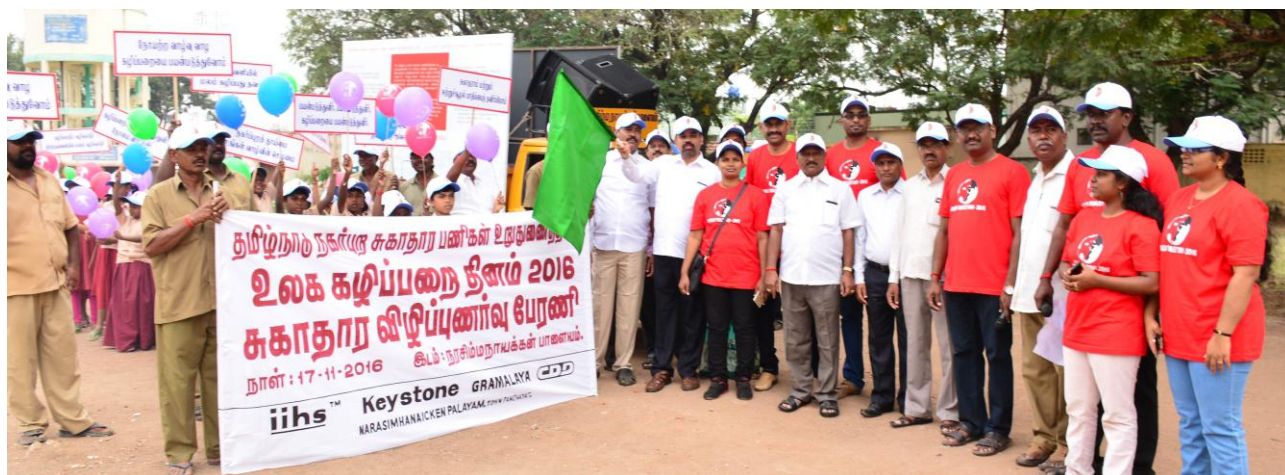
Figure 4.8: ADTP of Coimbatore inaugurating the awareness rally

A procession around the Narasimhanaicken-palayam Town Panchayat along with slogan chanting on sanitation was organised with 200 participants that included schoolchildren, members of self-help groups and sanitary workers. A vehicle equipped with public address system displaying sanitation messages led the awareness rally. Pre-recorded audio messages on the importance of improved sanitation were played as the vehicle went around the Town Panchayat. At the end of the procession, a quiz contest was held and participants were given prizes for correct answers.